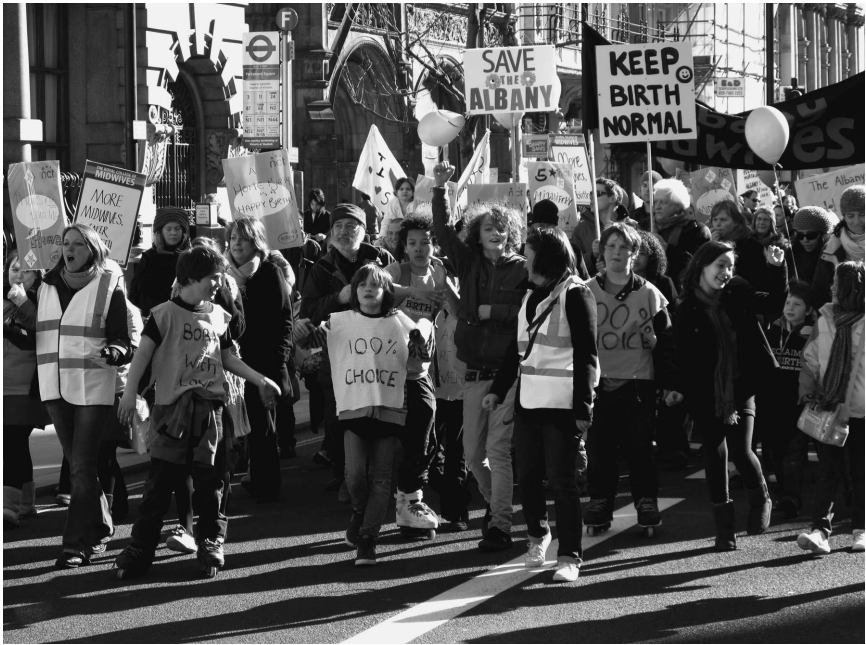
Figure 17.1 Reclaiming Birth March, London 2009

has now engaged national and international support for the wider issues of change: particularly one-to-one care from known and trusted midwives, more midwives, and more birth centres and home births. A rally in March 2010 to highlight these calls was supported by the Royal College of Midwives, the National Childbirth Trust, the Association for Improvements in the Maternity Services, the Association of Radical Midwives, Independent Midwives UK, Albany mums and the Albany Action Group. It is this sort of collective, cohesive action that might impact on maternity services.